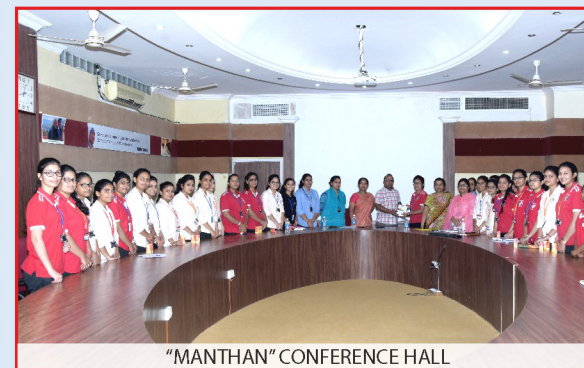
"MANTHAN" CONFERENCE HALL