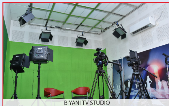
BIYANI TV STUDIO