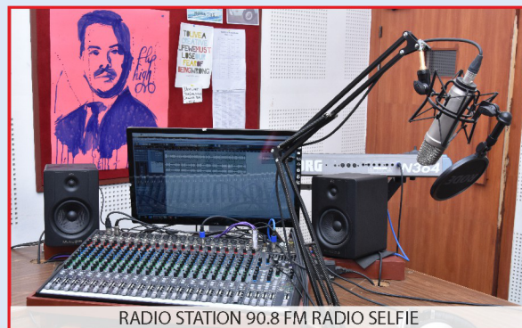
RADIO STATION 90.8 FM RADIO SELFIE